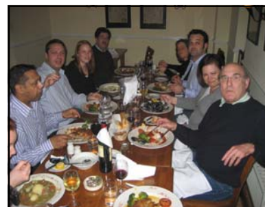
ESTHETIC CONFERENCES WERE HELD OVER DINNER...