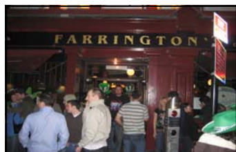
CROWDS PACKED THE MEETING