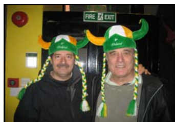
SPEAKERS WORE THEIR THINKING CAPS