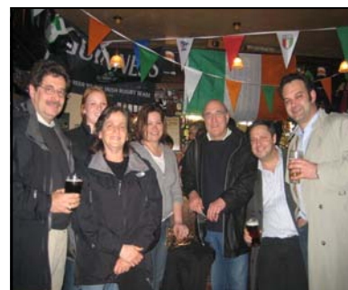
ESTHETIC CONFERENCES WERE HELD AFTER DINNER!!!